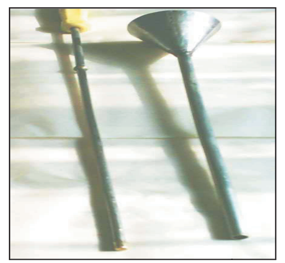
Fig. 1. Photo of a metal funnel with plunger for tube feeding of waterfowl.