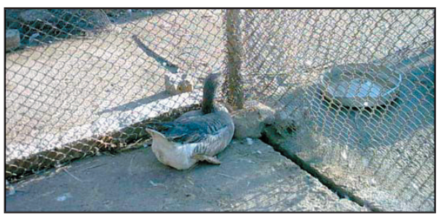
Fig. 2. Individual yard for gosling – the bird is placed here before the preliminary starving period.