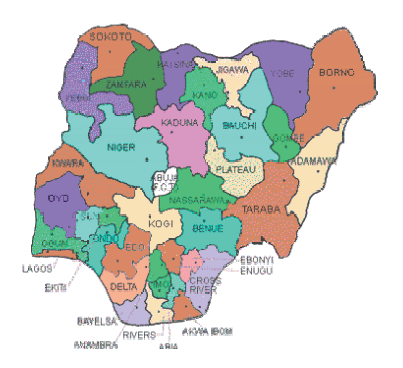
Map of Nigeria showing all the states.