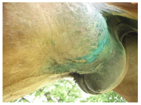
Fig. 5. Seromas Fig 5. Seroame

of the hernia repair. Anyway, this was associated with worsened health status and with the owner according the horse was proposed for euthanasia. We cannot say what kind of role presented the mesh here, because the necropsy was not performed.