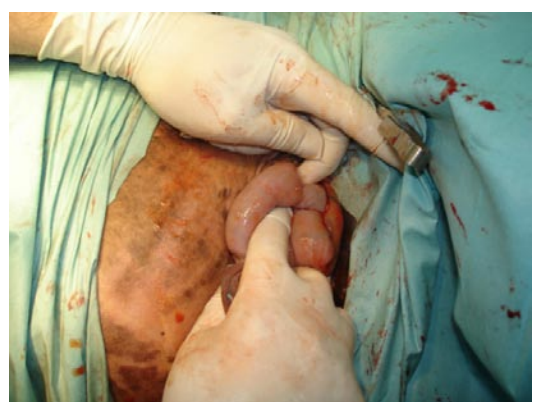
Fig. 2. Reducing of abdominal contents Fig. 2. Repunerea conținutului abdominal

supposed surgical manual labors in aseptic conditions. So, we performed an elliptical skin and subcutaneous tissue incision on long axis of tumefaction and hemostasis was permanently assured by forcipressure and vascular ligatures. Hernial sac was bluntly dissected and abdominal contents was reduced by twisting the sac and milking the contents through the ring (Fig. 2). It was appreciated the abdominal breach (Fig. 3) and the prosthetic mesh was adjusted for adequate dimensions