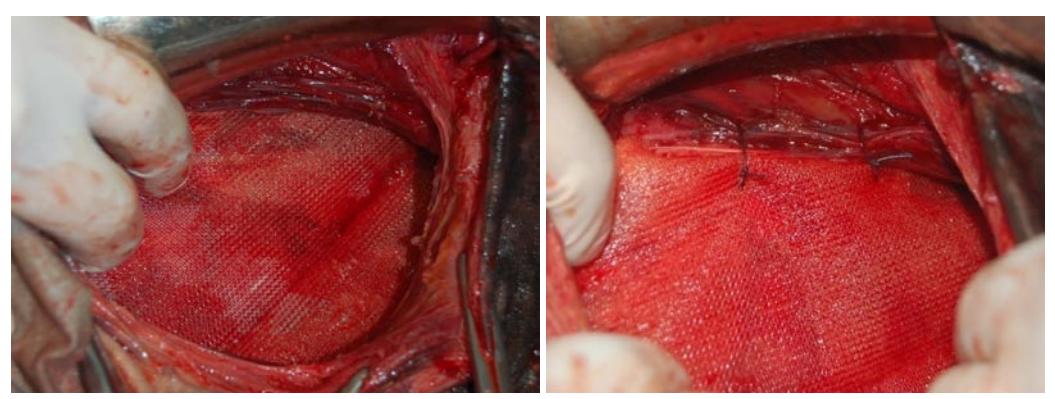
Fig. 4. Positioning and fixing of the prosthetic mesh in onlay position Fig. 4. Poziționarea și fixarea meșei protetice în poziția onlay

(in vivo it must surpass the edges of abdominal breach with 1 cm approximate). Then the mesh was fixed by onlay method (subcutaneous premuscular-aponevrothic or epifascial position) (Fig. 4).