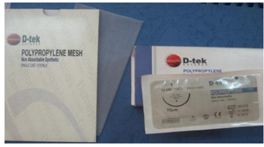
Fig. 1. Polypropylene mesh and wires used Fig. 1. Meşa din polipropilenă și firele utilizate

Contention. The animals were placed in dorsal (horses) and lateral recumbency (cows), opposite of the abdominal wall defect. The surgery place was aseptically prepared