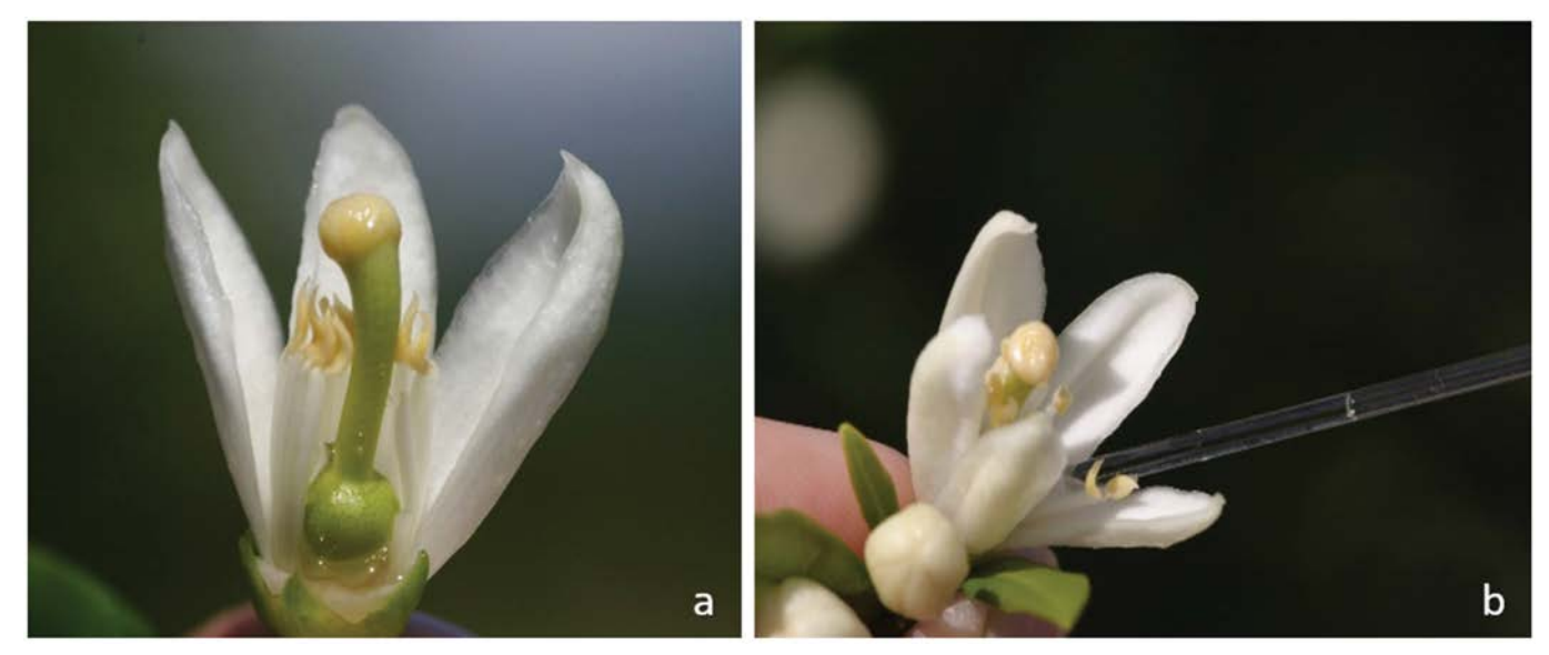
Figure 2a. Nectar secretion on the disk of Satsuma mandarin flower; Figure 2b. Nectar collection by microcapillary method