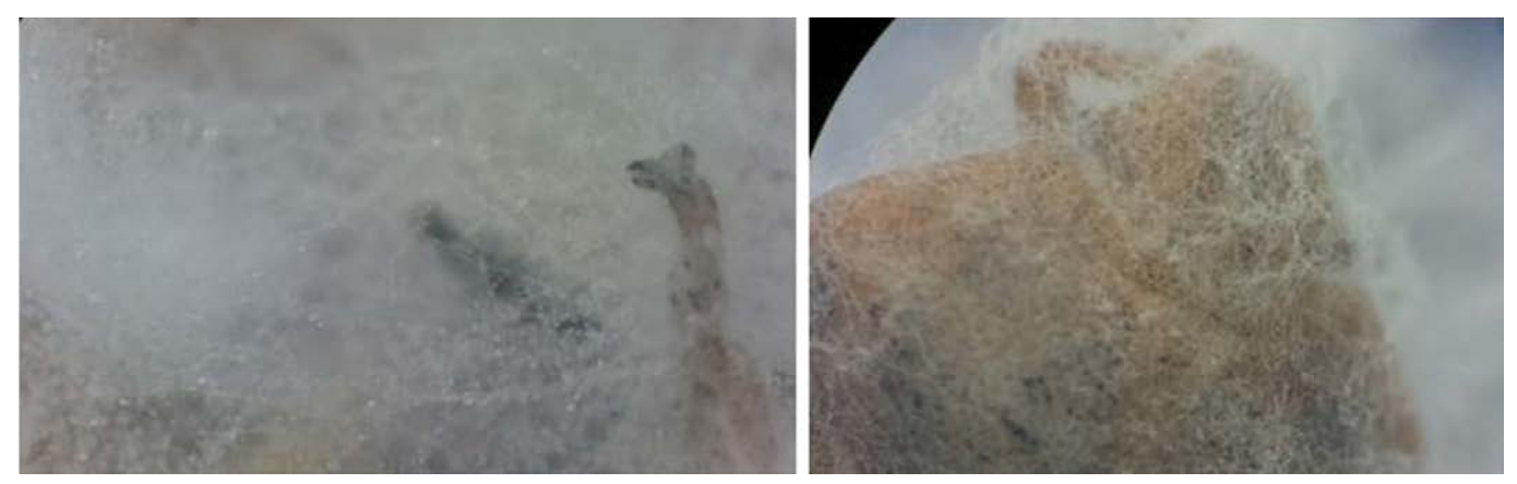
Figure 3. Growth of DIKA11/1 Akanthomyces muscarium isolate on sunn pest