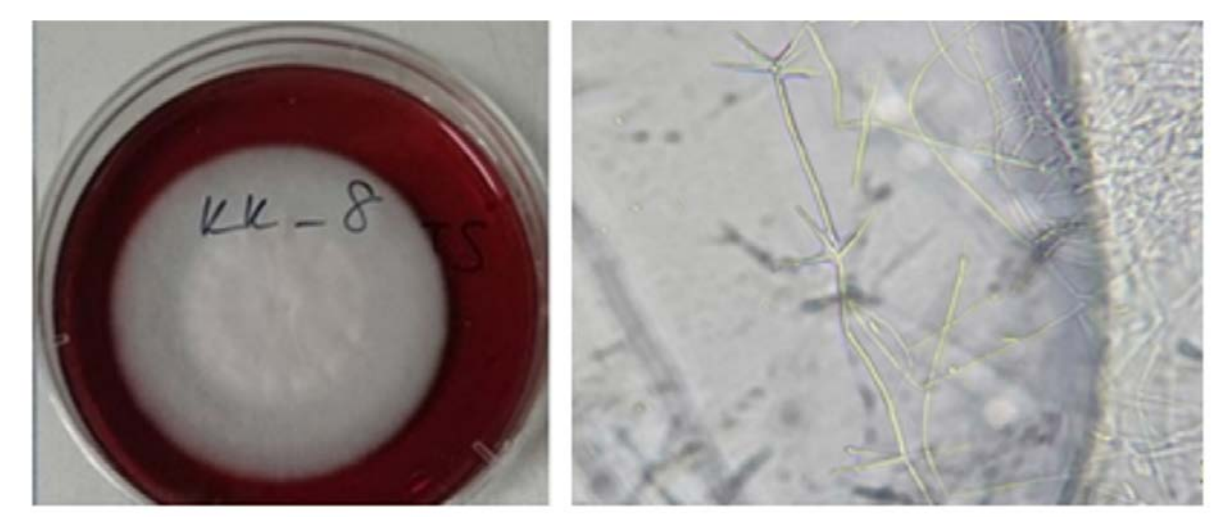
Figure 1. Culture of Lecanicillium psalliotae in PDA. Verticillate branching and conidia of the Lecanicillium psalliotae isolate

DIKA11/1, Akanthomyces isolate could not be separated from A. attenuatus and A. muscarium species according to sequences of the ITS region (Figure 2). Therefore, DIKA11/1 isolate was identified based on its morphological characters. The isolate has white colonies and did not produce pigment on the PDA and MEA media. The conidial chains were not observed. Ellipsoidal and cylindrical conidia were formed in more than five fascicles at the tips of the phialides. Phialides were measured as 10-30×1.25-2 \mu m. This isolate was identified as A. muscarium according to Zare and Gams (2001).