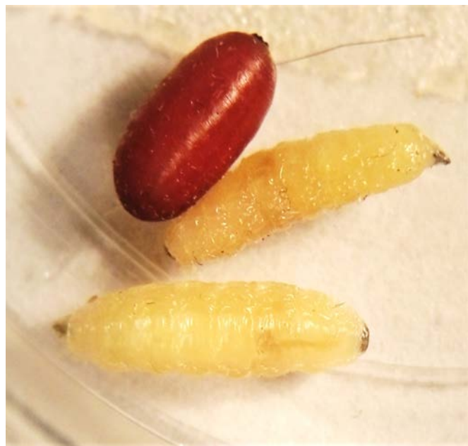
Figure 5. Larvae and pupa of T. pennipes