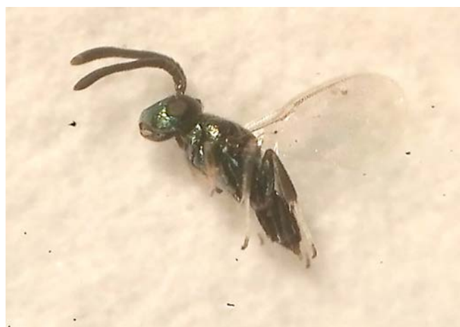
Figure 8 and 9. Adults of the egg parasitoids Trissolcus basal (left) and Anastatus bifasciatus (right)