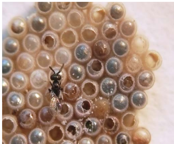
Figure 7. Parasitized eggs of N. viridula