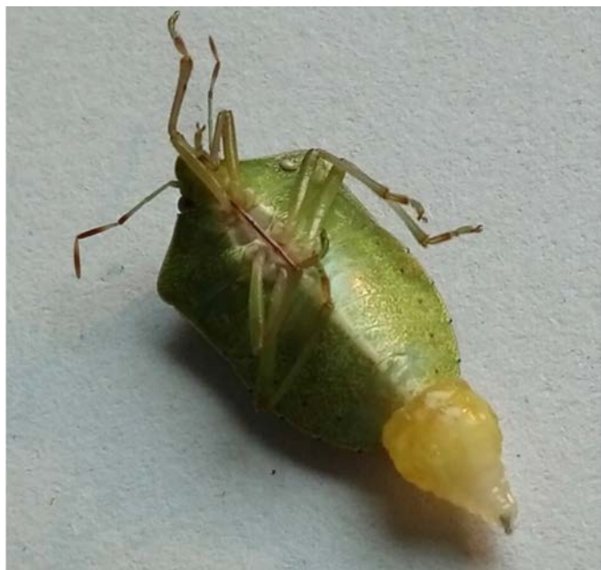
Figure 4. Larva of T. pennipes leaving the host through posterior abdominal segments