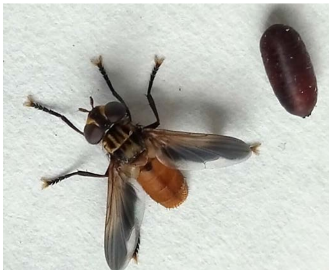
Figure 6. Adult T. pennipes emerged from the pupa