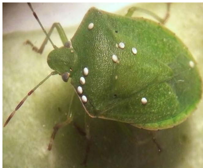
Figure 2 and 3. Eggs of T. pennipes laid on a nymph (left) and an adult (right) of N. viridula