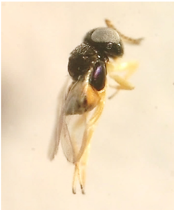
Figure 10. Adult of the egg parasitoid Ooencyrtus telenomicida

Trissolcus bassalis is an egg parasitoid and one of the main biological control agents of Nezara viridula . It has been used in many biological control programs worldwide (Jones, 1988; Colazza and Bin, 1995). From egg masses collected from potato and tomato plants in 2020 in the region of Plovdiv another parasitoid was identified - Ooencyrtus telenomicida (Vassiliev) (Hymenoptera: Encyrtidae) (Figure 10).