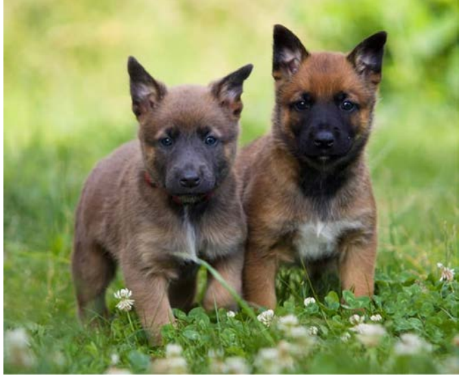
Figure 1. Phenotypic expression of the MLPH gene in the Malinois variety. The puppy on the left has a diluted colour and the puppy on the right has a standard fawn colour with a black mask

In some dogs the coat colour dilution is sometimes accompanied by hair loss and recurrent skin inflammation, the so called colour dilution alopecia (CDA) or black hair follicular dysplasia (BHFD) (Philipp et al., 2005a). Hereditary alopecia occurs as an autosomal recessive trait (Šťastná and Šťastný, 2018). Colour-dilution alopecia is a relatively uncommon hereditary skin disease in dogs, characterized by loss of coat in the colour-diluted areas of the skin. It is observed in "Blue" colouration which is a dilution of normal black colour (Figure 1) (Kim et al., 2005; Perego et al., 2009; Palumbo et al., 2012). This syndrome is associated with a colour-dilution gene. Disease is characterized by a progressive loss of hair, initial clinical signs are the gradual onset of a dry, dull and poor hair coat quality which is sensitive to sunburn or extreme cold. Hair shafts and hair regrowth are poor, and follicular papules may develop and progress to frank comedones. Hair follicles are characterized by atrophy and distortion. Heavily clumped melanin is present in the epidermis, dermis and hair follicles. Disease may be accompanied by recurrent bacterial infections of the hair follicles (folliculitis) (Kim et al., 2005; Philipp et al., 2005b). Canine black hair follicular dysplasia (BHFD) is a rare disorder confined to black coat regions affecting bicolour or tricolour animals within the first few weeks of life (von Bomhard et al., 2006).