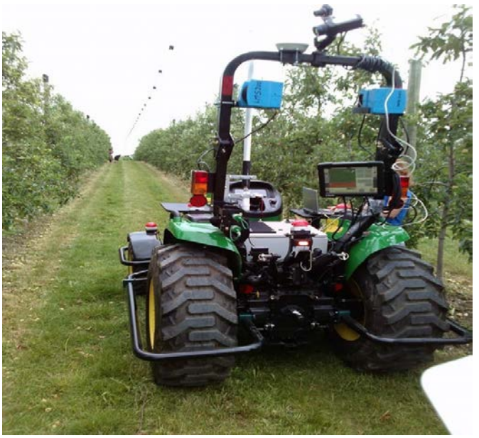
Figure 2. Sensors mounted on robotic platform during field data collection

Mobile sensors are mounted on a portable platform (robotic vehicle) that can be remotely guided in the field to make imaging by several sensors such as thermal camera, RGB, hyperspectral camera and laser scanner, simultaneously. During data collection, portable computer and wet reference bath are attached to the mobile platform. A picture of the mobile platform with sensors mounted on it during in-field data collection is shown in Figure 2.