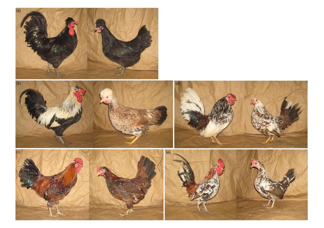
Figure 1. Males (left) and females (right) of five Polish local chicken varieties: (a) crested chickens from Ryczki; (b) crested chickens from Hucisko; (c) chickens from Subcarpathian region; (d) miniature chickens from Podolszynka Ordynacka; (e) miniature chickens from Pilchów