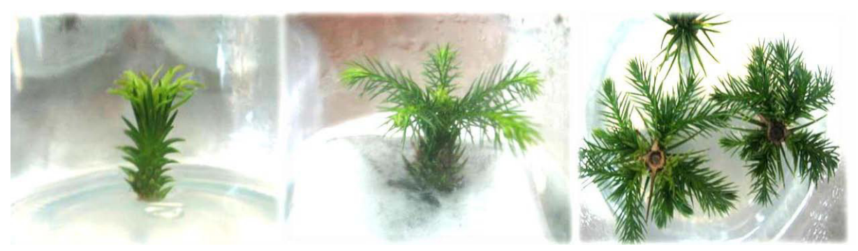
Fig. 2. Araucaria excelsa R. Br. shoot proliferation after 60 days culture of shoot explants on the medium supplemented with 0.045 \mu M TDZ.

In most cases, application of 500 µg/ml nano silver for 5-10 min before surface sterilization reduced the contamination to less than 18% [16]. Apical parts of orthotropic stems can be used for good multiplication (Fig. 2). Explants grown in medium supplemented with TDZ, were morphologically better than other explants treated with plant growth regulators (PGRs) (Fig. 2), hence the explants treated with TDZ were used for further experiments [17].